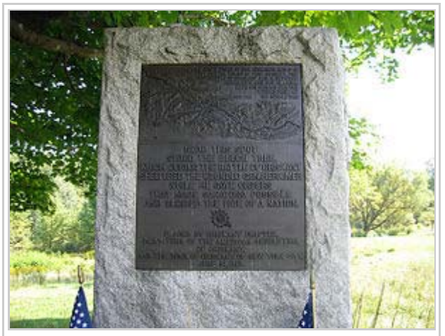
Monument marking location of tree to which Herkimer was taken

About six miles (9.6 km) from the fort, the road dipped more than fifty feet (15 m) into a marshy ravine, where a stream about three feet (1 m) wide meandered along the bottom.<sup>[17]</sup> Sayenqueraghta and Cornplanter, two Seneca war chiefs, chose this place to set up an ambush.<sup>[18]</sup> While the King's Royal Yorkers waited behind a nearby rise, the Indians concealed themselves on both sides of the ravine. The plan was for the Yorkers to stop the head of the column, after which the Indians would attack the extended column.<sup>[17]</sup> At about 10 am, Herkimer's column, with Herkimer on horseback near the front, descended into the ravine, crossed the stream, and began ascending the other side.<sup>[14]</sup>