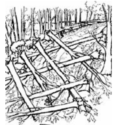
A road blocked by a "giant abatis" such as delayed St. Leger's artillery.

The Tryon County Committee of Safety received news of St. Leger's movements on July 30, and set about raising additional troops. On August 4, about 800 men from the Tryon County militia were mustered at Fort Dayton