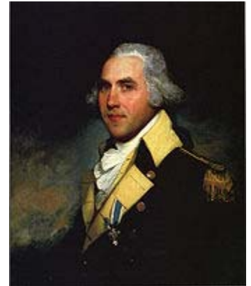
Peter Gansevoort, oil painting by Gilbert Stuart

Schuyler had received early reports of the action at Oriskany on August 8, [31] and dispatched Ebenezer Learned's 4th Massachusetts Regiment to relieve the besieged fort the next day. [32] On August 12, even before Willett could reach him, Schuyler held a war council to decide how to deal with the combined threats of St. Leger and Burgoyne, whose large army had reached the Hudson River. [33] Amid concerns that the withdrawal from Ticonderoga by General Arthur St. Clair would be repeated at Stanwix, the council decided, with near unanimity, not to send a relief column to Fort Stanwix. In opposition to the council, Schuyler insisted on a relief expedition, which Arnold offered to lead. [34] In addition to Schuyler's actions, Major General Israel Putnam, based in Peekskill, New York, on August 14 dispatched two regiments (the 1st Canadian and the 2nd New York), which were already on guard duty in the Mohawk River valley. These two units were still en route when the siege was lifted, and turned back. [35]