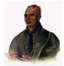
19th century illustration of Joseph Brant

St. Leger took advantage of his victory to deliver another demand for the fort's surrender, which Gansevoort also rejected. The next day St. Leger sent in a third surrender demand, which included (false) news that Burgoyne was in Albany as well as threats that the Indians would be permitted to massacre the garrison and destroy the Mohawk valley communities from which the garrison was drawn. [28] In an eloquent refusal, Lieutenant Colonel Willett responded, "By your uniform you are British officers. Therefore let me tell you that the message you have brought is a degrading one for a British officer to send and by no means reputable for a British officer to carry." [29]