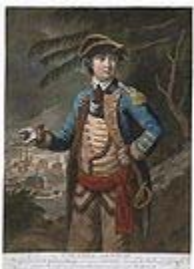
A 1776 mezzotint of Benedict Arnold

By August 20, Arnold, Willett and 700 Continental Army regulars had arrived at Fort Dayton. [36] In an attempt to enlarge his force, Arnold tried to interest the Tryon County men in another attempt against St. Leger, but raised only about 100 men. He then decided to wait, hoping that friendly Oneidas and Tuscaroras could be convinced to join the effort, or that a request to Schuyler for another 1,000 men would be fulfilled. [29] However, news reached him that the siege had reached a critical stage, and that action was necessary. St. Leger had learned that his guns were largely ineffective against the fort's walls from long range, so he began entrenching operations to establish positions closer to the fort. Gansevoort reported that the siege trenches had reached within striking distance of one of the fort's bastions. [37]