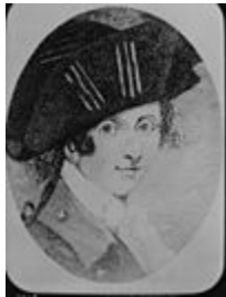
18th-century engraving of Barry St. Leger

Although they officially renamed the fort to Fort Schuyler , it was still widely known by its original name. Warnings from the friendly Oneida Indians that the British were planning an expedition to the Mohawk Valley were confirmed by mid-July, spurring the pace of the work. [8][9] In early July, Gansevoort reported on the state of affairs to Schuyler, noting that provisions and ammunition were in short supply. Schuyler ordered additional supplies sent to the fort on July 8. [10]