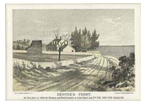
Denyse's Ferry, the first place at which the Hessians and British landed on Long Island August 22, 1776 by A. Brown. This high point overlooking the Narrows was an American artillery position and was bombarded by the British before the invasion, but the actual landing took place farther east at Gravesend Bay (around to the left from the perspective of this illustration) where the conditions were more favorable for the small British boats carrying the troops.