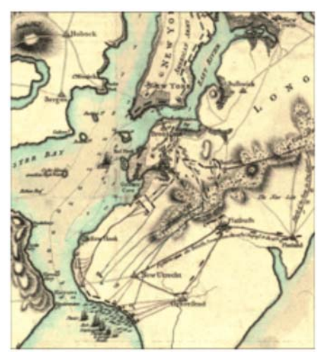
British military map from 1776 showing the marching routes and battle sites during the Battle of Long Island

The American plan was that Putnam would direct the defenses from Brooklyn Heights, while Sullivan and Stirling and their troops would be stationed on the Guan Heights.<sup>[48]</sup> The Guan (hills) were up to 150 feet high and blocked the most direct route to Brooklyn Heights. [48][49] Washington believed that, by stationing men on the heights, heavy casualties could be inflicted on the British before the troops fell back to the main defenses at Brooklyn Heights.<sup>[50]</sup> There were three main passes through the heights; the Gowanus Road farthest to the west, the Flatbush Road slightly farther to the east, in the center of the American line where it was expected that the British would attack, and the Bedford Road farthest to the east. Stirling was responsible for defending the Gowanus Road with 500 men, and Sullivan was to defend the Flatbush and Bedford roads where there were 1,000 and 800 men respectively.<sup>[48]</sup> Six-thousand troops were to remain behind at Brooklyn Heights. There was one lesser-known pass through the heights farther to the east called the Jamaica Pass, which was defended by just five militia officers on horses.[51]