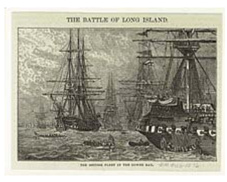
The British fleet in the lower bay (Harpers Magazine, 1876) depicts the British fleet amassing off the shores of Staten Island in the summer of 1776

troops began to land on Staten Island. The continental regulars on the island took a few shots at them before fleeing, and the citizens' militia switched over to the British side.<sup>[28]</sup>