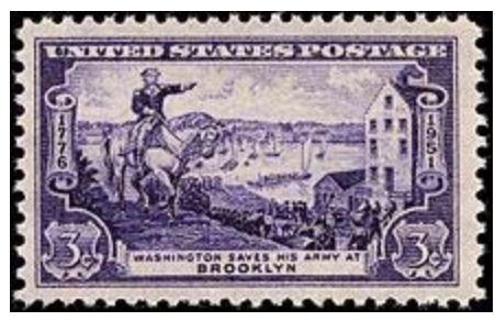
Washington evacuating Army 175th Anniversary Issue of 1951. Accurate depiction of Fulton Ferry House at right. Flat-bottomed ferry boats in the East River are depicted in the background.

Artillery, supplies, and troops were all being evacuated across the river at this time but it was not going as fast as Washington had anticipated and daybreak soon came.<sup>[83]</sup> A fog settled in and concealed the evacuation from the British. British patrols noticed that there did not seem to be any American pickets and thus began to search the area. While they were doing this, Washington, the last man left, stepped onto the last boat.<sup>[76]</sup> At 07:00, the last American troops landed in Manhattan.<sup>[84]</sup> All 9,000 troops had been evacuated with no loss of life.<sup>[84]</sup>