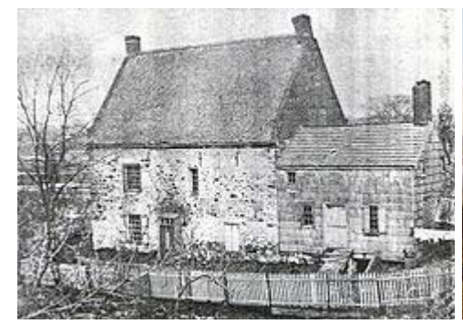
The front of the original Vechte-Cortelyou House (built c.1699), where the Maryland troops commanded by Lord Stirling and Mordecai Gist made two attacks against over two thousand British troops in a rearguard action that allowed a majority of Stirling's 1,600-strong command to escape. The house was reconstructed with original materials in 1937 after a fire. [66]

Stirling ordered all of his troops to cross the creek, except a