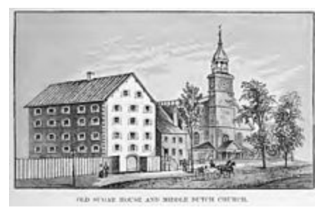
The Middle Dutch Church is where some of the enlisted men captured at the Battle of Long Island were imprisoned. The Sugar House also became a prison as the British captured more of Washington's soldiers during the retreat from New York. The site today is the location of the Chase Manhattan Bank. [93]

The most significant legacy of the Battle of Long Island was that it showed there would be no easy victory, and that the war would be long and bloody. [93]:2