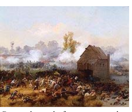
Gunpowder smoke from cannons and muskets mark where Stirling and the Maryland troops attack the British, while the rest of the American troops in the foreground escape across Brouwer's mill pond. The building pictured is the mill. ( Battle of Long Island , 1858 Alonzo Chappel)

contingent of Maryland troops under the command of Gist. This group became known to history as the "Maryland 400", although they numbered about 260–270 men. Stirling and Gist led the troops in a rear-guard action against the overwhelming numbers of British troops, which surpassed 2,000 supported by two cannons. [69] Stirling and Gist led the Marylanders in two attacks against the British, who were in fixed positions in and in front of the Vechte-Cortelyou House (known today as the Old Stone House). After the last assault, the remaining troops retreated across the Gowanus Creek. Some of the men who tried to cross the marsh were bogged down in the mud and under musket fire, and others who could not swim were captured. Stirling was surrounded and, unwilling to surrender, broke through the British lines to von Heister's Hessians and surrendered to them. Two hundred fifty six Maryland troops were killed in the assaults in front of the Old Stone House, and fewer than a dozen made it back to the American lines. [70] Washington watched from a redoubt on nearby Cobble Hill (intersection of today's Court Street and Atlantic Avenue) and reportedly said, "Good God, what brave fellows I must this day lose." [69][note 1]