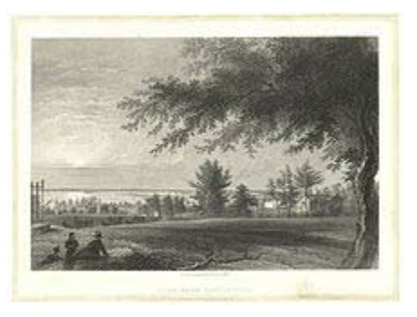
A view from Battle Hill - the highest point in King's County - looking west toward Upper New York Harbor and New Jersey beyond.. Here on Lord Stirling's left flank about 300 Americans under Colonel Atlee and General Parsons repulsed successive attacks by the British after taking the hill, and inflicted the highest casualties against the British during the Battle of Long Island. [57]

Stirling placed Atlee's men in an apple orchard owned by Wynant Bennett on the south side of the Gowanus Road near present-day 3rd Avenue and 18th Street. Upon the approach of the British, the Americans: