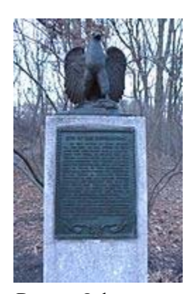
Dongan Oak memorial in Prospect Park

■ The Altar to Liberty: Minerva monument: The battle is commemorated with a monument, which includes a bronze statue of Minerva near the top of Battle Hill, the highest point of Brooklyn, in Green-Wood Cemetery. The statue was sculpted by Frederick Ruckstull and unveiled in 1920. The statue stands in the northwest corner of the cemetery and gazes directly at the Statue of Liberty in New York Harbor. In 2006, the Minerva statue was invoked in a successful defense to prevent a building from blocking the line of sight from the cemetery to the Statue of Liberty in the harbor. The annual Battle of Long Island commemoration begins inside the main Gothic arch entrance to Green-Wood Cemetery and marches up Battle Hill to ceremonies at the monument. [96]