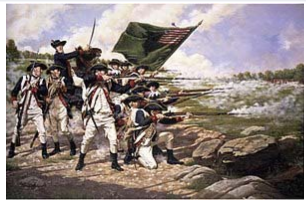
The Delaware Regiment at the Battle of Long Island