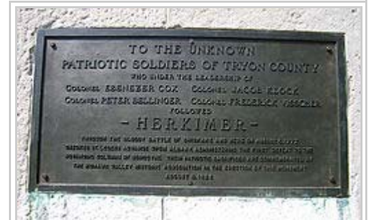
Monument to the unknown Tryon County patriots

Nicholas Herkimer was honored when the town of Herkimer and Herkimer County, New York were named for him. [46]