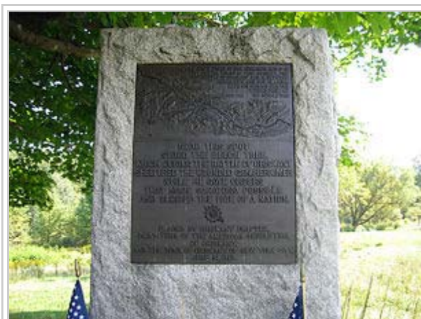
Monument marking location of tree to which Herkimer was taken

Contrary to the plan, the Indians lying in wait near the rear of the column, apparently unable to contain themselves any longer, opened fire, taking the column completely by surprise. Leading the 1st Regiment (Canajoharie district), Colonel Ebenezer Cox was shot off his horse and killed in the first volley. Herkimer turned his horse to see the action, and was very shortly thereafter struck by a ball, which shattered his leg and killed the horse. [19] He was carried by several of his officers to a beech tree, where his men urged him to retire from further danger. He defiantly replied, "I will face the enemy", and calmly sat leaning against the tree, smoking a pipe and giving directions and words of encouragement to the men nearby. [20]