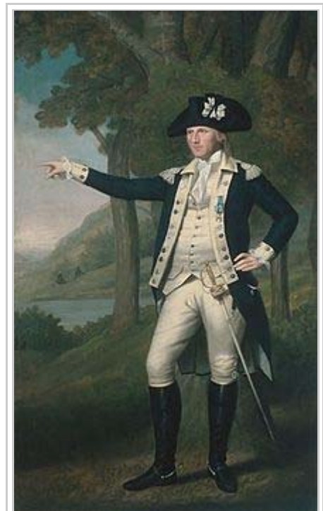
Lt. Col. Marinus Willett, a 1791 portrait by Ralph Earl