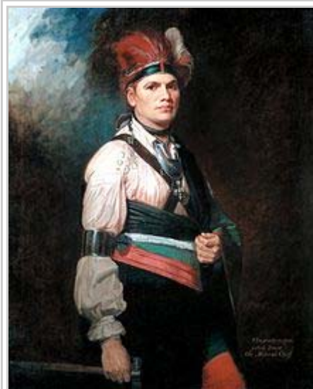
The Mohawk leader Chief Joseph Brant, 1776 portrait by George Romney

The battered remnant of Herkimer's force, with Herkimer seriously wounded and many of its captains killed, retreated to Fort Dayton. The wounded Herkimer was carried by his men from the battlefield. His leg was amputated, but the operation went poorly and he died on August 16. [31] While the Indians retrieved most of their dead from the battlefield the following day, many dead and wounded Patriots were left on the field. When Benedict Arnold's relief column marched through the scene several weeks later, the stench and grisly scene was, according to various accounts, quite memorable. [32]