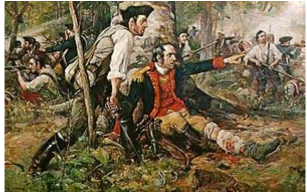
Herkimer at the Battle of Oriskany