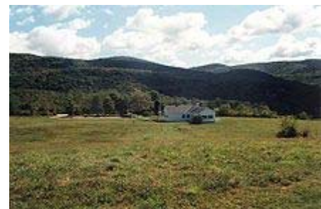
Hubbardton Battlefield Visitor Center