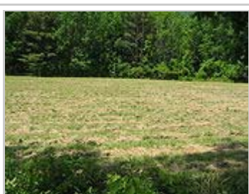
West side of Monument Hill; British forces attacked up (towards the camera) this hill

At some point early in the conflict, St. Clair was made aware of the gunfire off in the distance. He immediately dispatched Henry Brockholst Livingston and Isaac Dunn to send the militia camped closest to Hubbardton down the road in support of the action. [3] When they reached the area of those camps they found those militia companies in full retreat away from the gunfire in the distance, and no amount of persuasion could convince the men to turn around. Livingston and Dunn continued riding toward Hubbardton. [22]