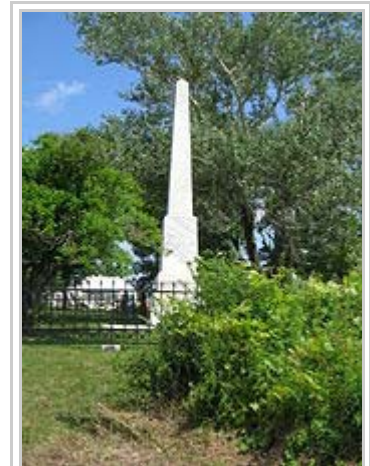
Monument erected in 1859 at the battlefield

A local body commissioned the erection of a monument on the battlefield site in 1859, and the state began acquiring battlefield lands in the 1930s for operation as a state historic site. The battlefield was added to the National Register of Historic Places in 1971, and is the site of annual Revolutionary War reenactments. [4][33] The site's visitor center features a permanent exhibit tells the story of the Battle of Hubbardton and places it in its context of the Revolutionary War. The Hubbardton Battlefield Trail features interpretive signs highlighting important points and locations of the battle.