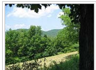
The military road to Hubbardton passed (and still passes) through the center gap in the hills in the photo's background