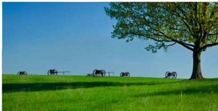
Gettysburg Day 1

5am - Confederate Major General Henry Heth's Division sets out for Gettysburg from Cashtown. To the west of town Union Brig. General John Buford's Cavalry Division sits just west of town with 2,700 troops. Advanced skirmishers have been deployed to meet the Confederate advance.