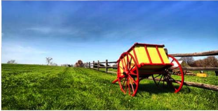
Gettysburg Day 3

5:30-10:30am - Confederate Major General Edward Johnson planned to renew the attack at first light once more reinforcements were available, and still believed he faced larger numbers.