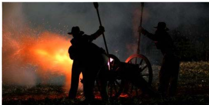
Gettysburg Day 2